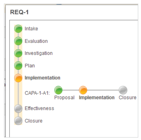
Standardize on robust, well-controlled post-market processes.